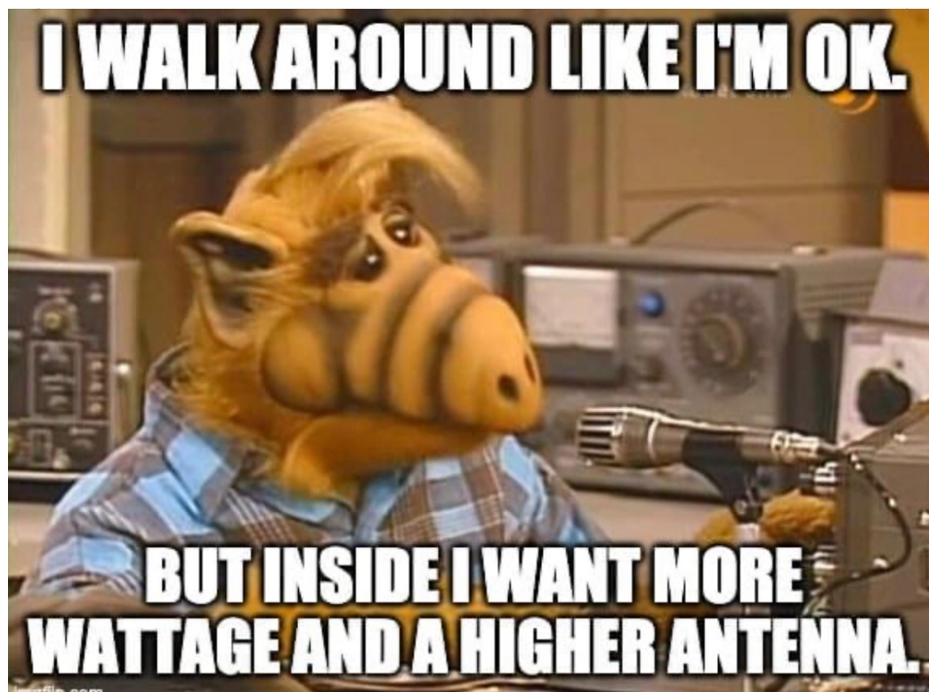
GOTAhams Amateur Radio Club